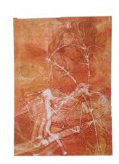
1/1. Bra/Jolly fit/ Full cup bra, Atteriya/ Murratapaniculata. Collagraphy. Ink on paper. size 25.5 X 35.5 cm. 2017. by Buddhika Nakandala