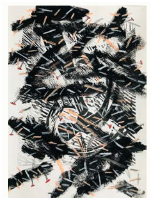
mix medium print. paper on printing ink. acrylic and collage. 35 x 50cm. 2018. by Anusha Gajaweera